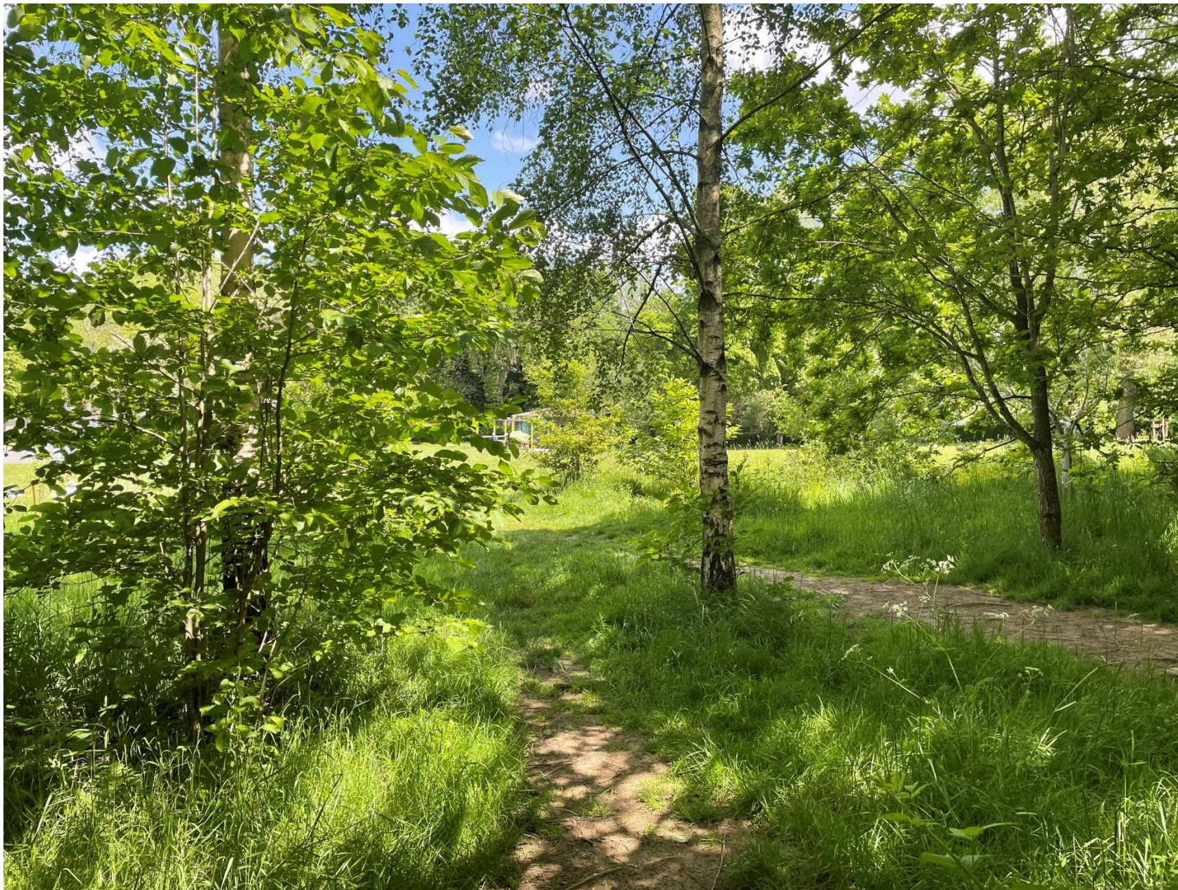
Image: The Shed from the Millennium Wood