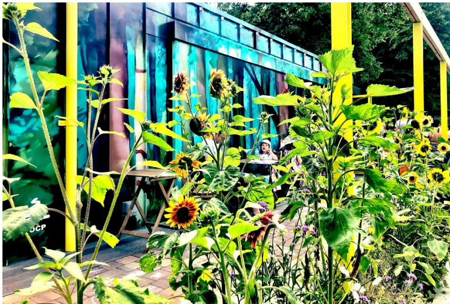
Image: The Shed with its Summer sunflowers

The Shed celebrated its 2nd birthday in August 2022.